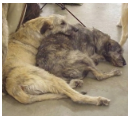
Two contestants just chilling out at the show